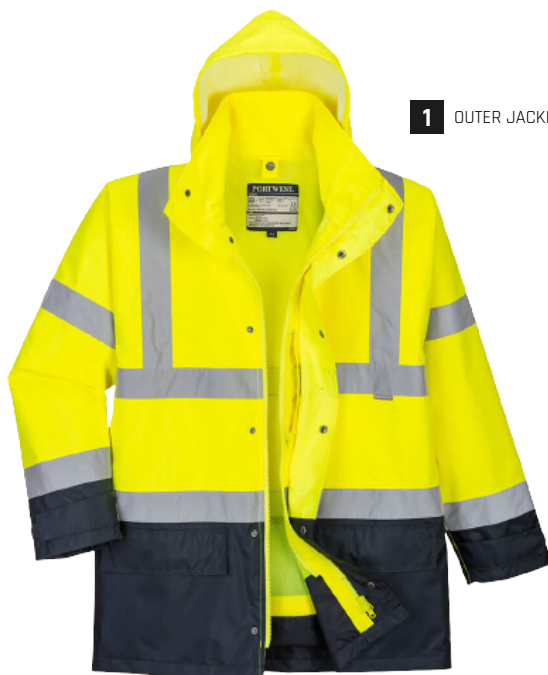
1 OUTER JACKET