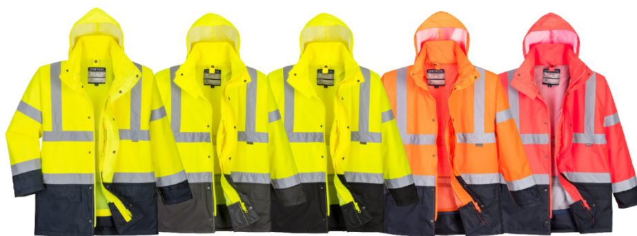
Available colors and sizes: